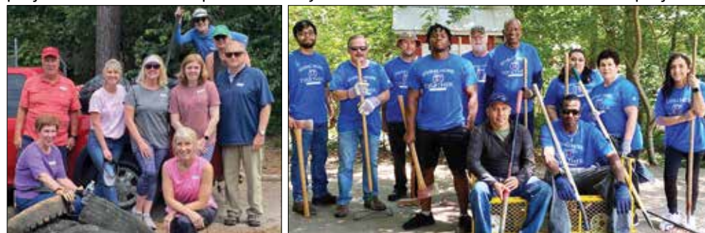
PICTURED L-R: Volunteers from Stribling-Whalen Financial Group spent the day cleaning trash and debris from the Nature Preserve (A Avenue). Volunteers from ZF Industries spent the day helping spruce up the Elachee grounds.

We are grateful to area businesses and groups seeking community service or volunteer projects that can be completed in a day or less. Call 770-535-1976 to schedule a project!