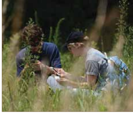
University of North Georgia-Gainesville students assess pollinator activity to collect data during a field lab study at Chicopee Lake.