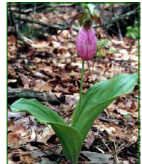
Pink Lady's slipper