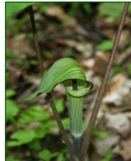
Jack in the Pulpit